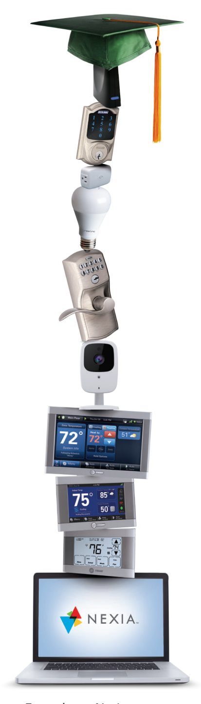
Expand your Nexia system by adding compatible smart products.** Whenever you want to grow your home's connections, Nexia can offer you a way. Ask your Trane dealer for details, or visit nexiahome.com.

Upgradable software comes standard with all of our Nexia-enabled controls so you'll be current with all of the latest innovations available.